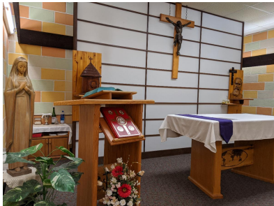
Cincinnati Mission Center First Friday Mass 8 a.m. Friday, May 1 Facebook