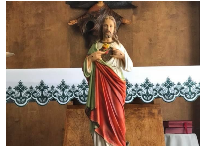
Covina Mission Center Mass, youth events, and more - all online Facebook